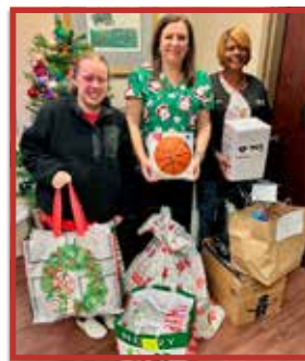
Christmas Premier Medical West Donation