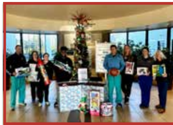
The Orthopaedic Group Toy Donation