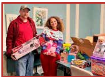
Hall's Wholesale Florist Toy Donation