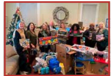
Long & Long Attorneys Toy Donation