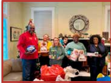
Strikers Club Donation