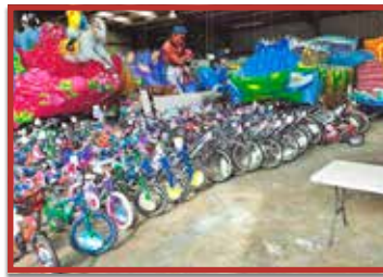
Conde Cavaliers Mardi Gras Organization Bicycle Donation