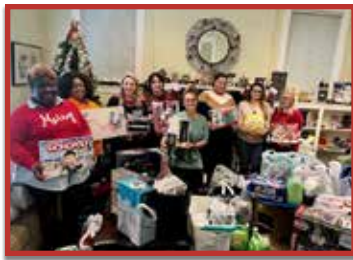
American WeatherStar Toy Donation