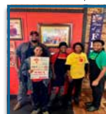
Saucy Q Bar B Que