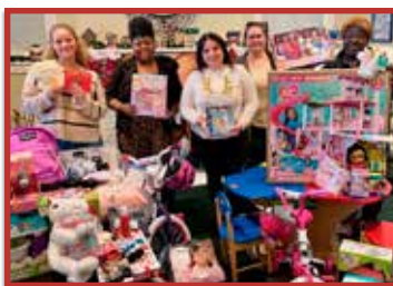
Signius Toy Donation