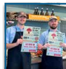
Jersey Mike's Subs Dauphin St