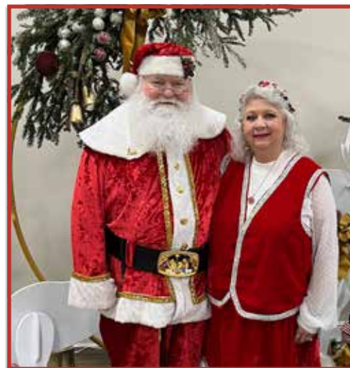
Santa and Mrs. Claus