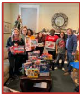
92ZEW ALL STAR Christmas Jam Toy Donation