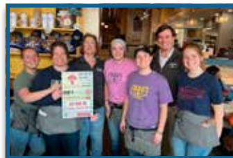
Big Bad Breakfast