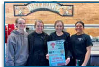
Hickory Pit Too