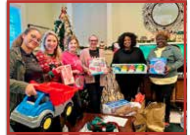
Mobile Tennis Center Tennis Social Donation