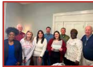
Howard Lodge Donation