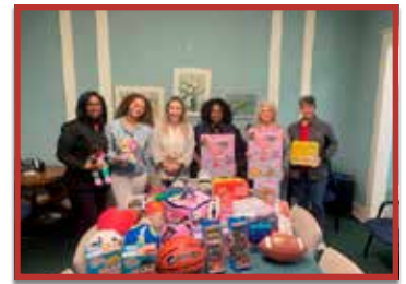
Alabama Power Service Group toy Donation