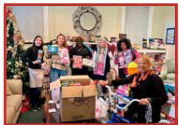
Volunteers of America Toy Donation