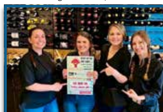
Briquettes Eastern Shore