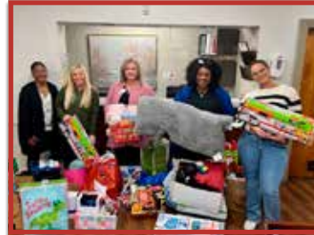
Premier Medical East Donation