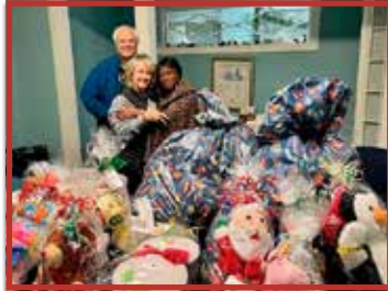
I Love You More Donation