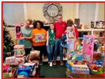
Waring Oil Staff Donation