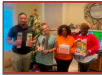
Exit Realty Lyon