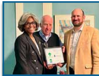
Thank you Renasant Bank, Title Sponsor, KSJ Radio, Al.com, and Budweiser Busch Distributor