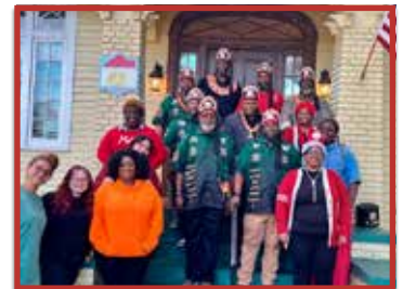
Shriners Palestine #18