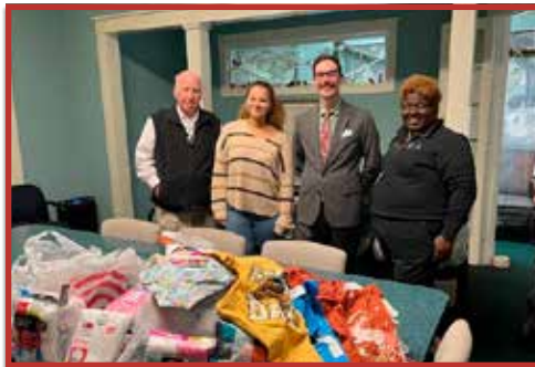
Ruth's Chris Essentials Donations

We appreciate Ruth's Chris Steak House inviting their Patrons to make donations of necessities for children and teens for children at the CAC. Thank you for your kindness.