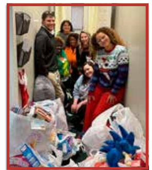
Pilot Give Back Program Donation