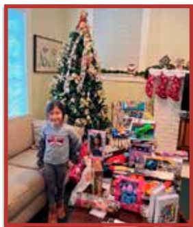
iXL Realty Mobile & Baldwin Counties Toy Donation