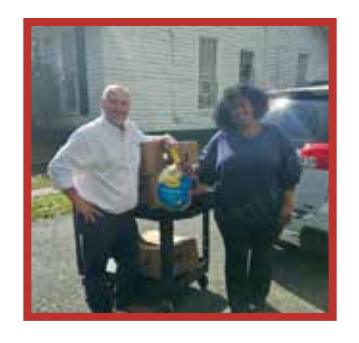
Evonik Turkey Donations