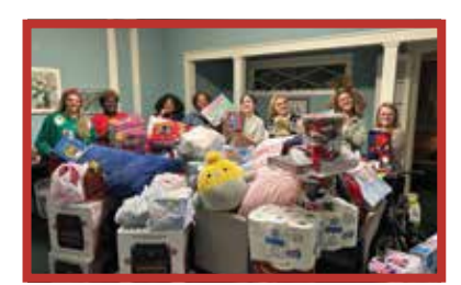
American Weather Star Toy Donation