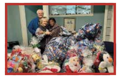
I Love You More Donation